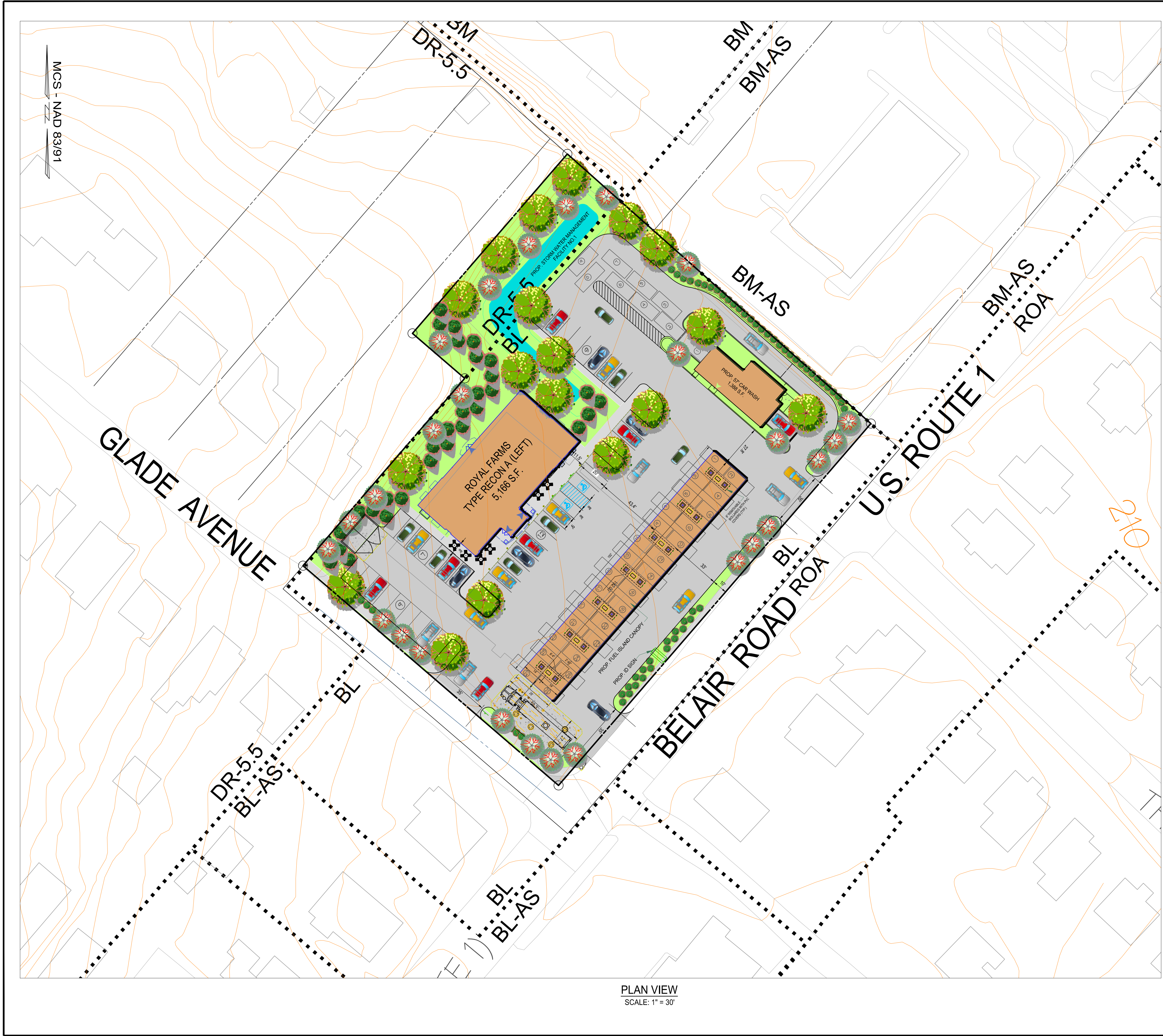
PLAN VIEW SCALE: 1" = 30'