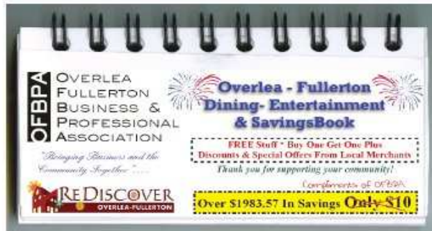
2010 Book Cover

Attractive full color front and rear covers represents Your Community. Consumers will hold on to these for months.